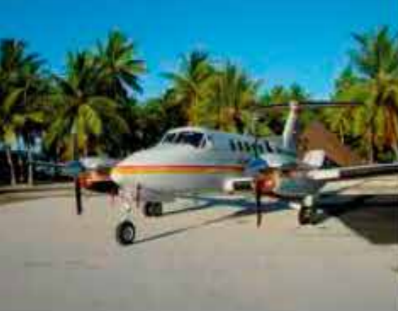
PRIVATE JET CHARTERS